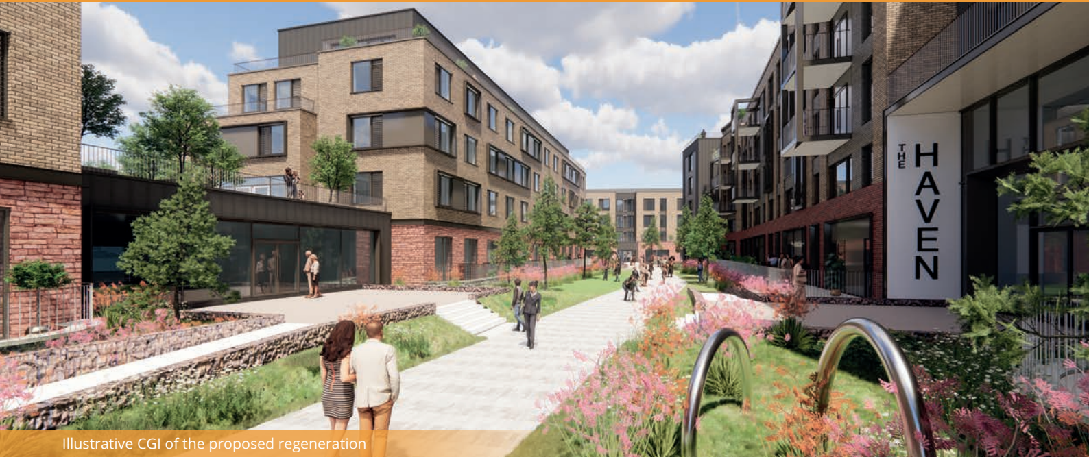
Illustrative CGI of the proposed regeneration