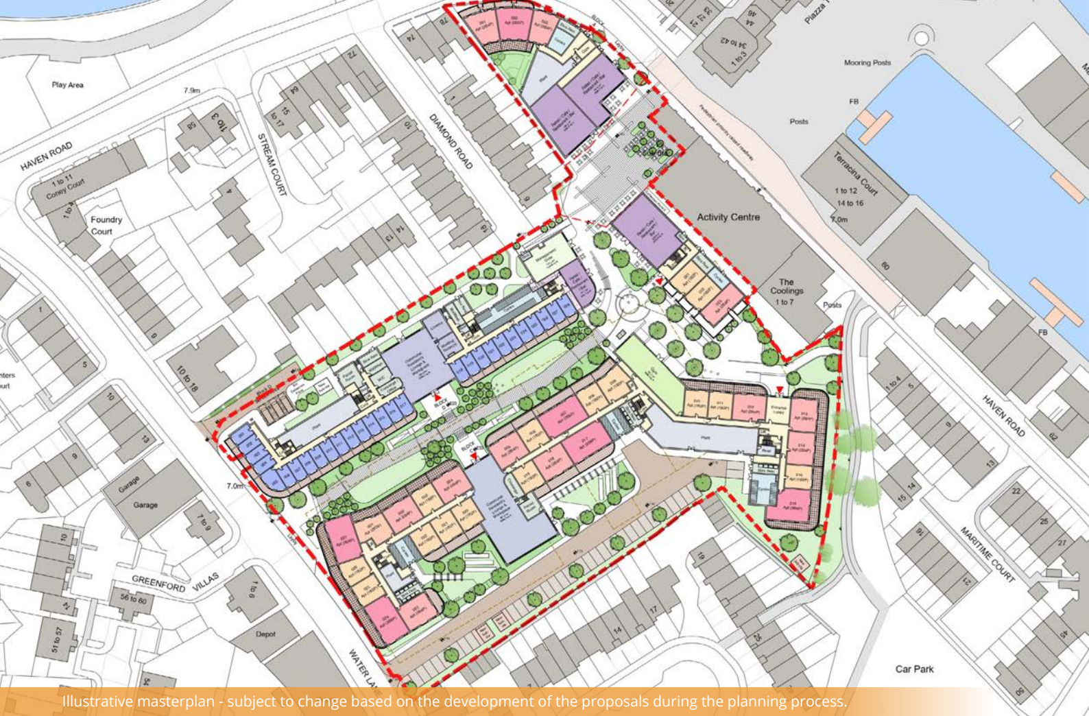
Illustrative masterplan - subject to change based on the development of the proposals during the planning process.